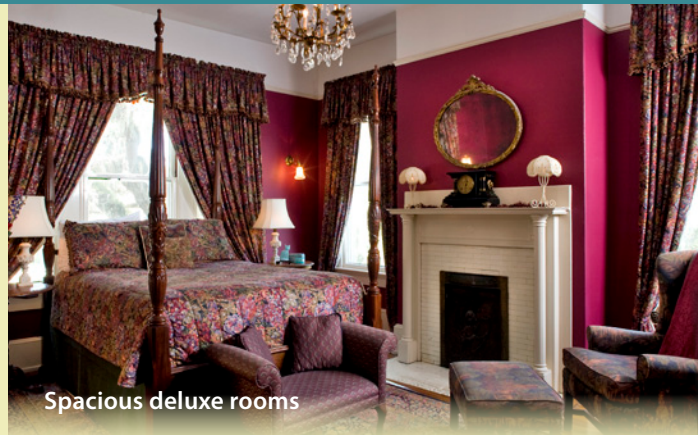
Spacious deluxe rooms

Located in the Historic District of the seaside town of Fernandina Beach, Florida, Hoyt House is steps away from marvelous restaurants and every variety of boutiques and antique shops.