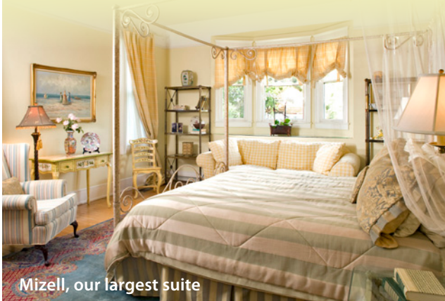
Mizell, our largest suite