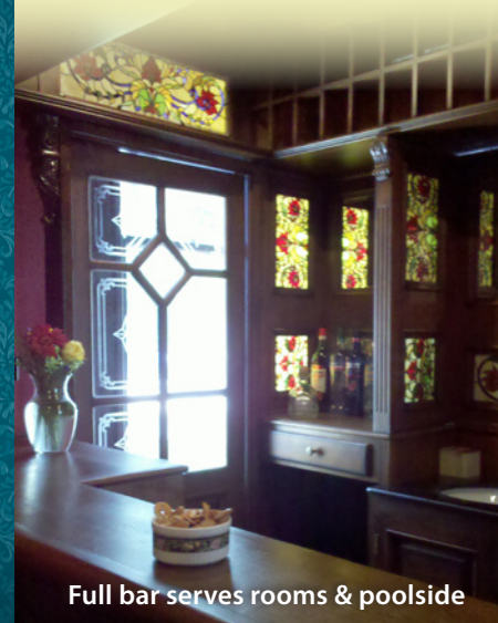
Full bar serves rooms & poolside

The Hoyt House will teach you how to Relearn how to Relax.