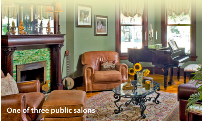
One of three public salons